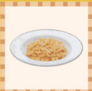
MACARONI & CHEESE