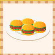
GRILLED NATURAL CHICKEN SLIDERS (2) WITH ONE SIDE