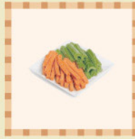
CARROT & CELERY STICKS