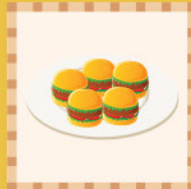
CHEESEBURGER SLIDERS WITH ONE SIDE