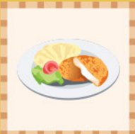
NAKED NATURAL CHICKEN TENDERS WITH ONE SIDE

Delicious and healthy meals for your child