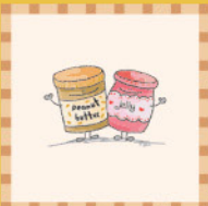
PEANUT BUTTER & SEASONAL HOMEMADE JELLY