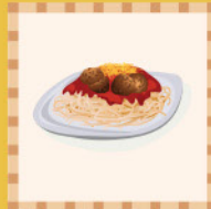
ORGANIC SPAGHETTI & TURKEY MEATBALLS