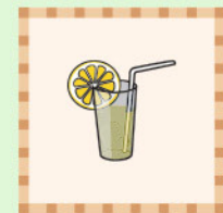
HONEY LEMONADE $2 ORGANIC MILK $2