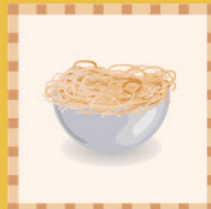
ORGANIC PASTA W/BUTTER